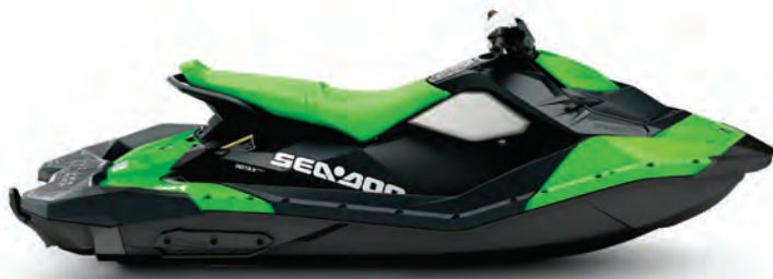
SPARK 3up Key Lime coloration and optional iBR