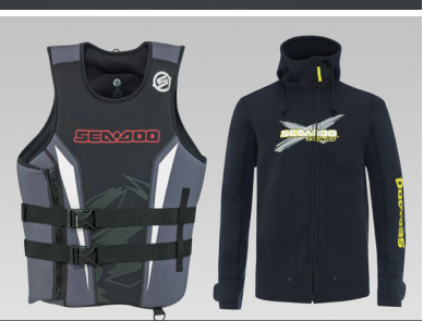
FORCE PULLOVER PFD X-TEAM NEOPRENE RIDING JACKET (OPTION)