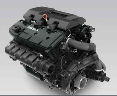
ROTAX® 1630 ACE™ ENGINE