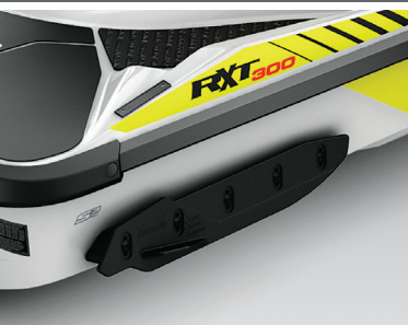
ADJUSTABLE REAR SPONSONS